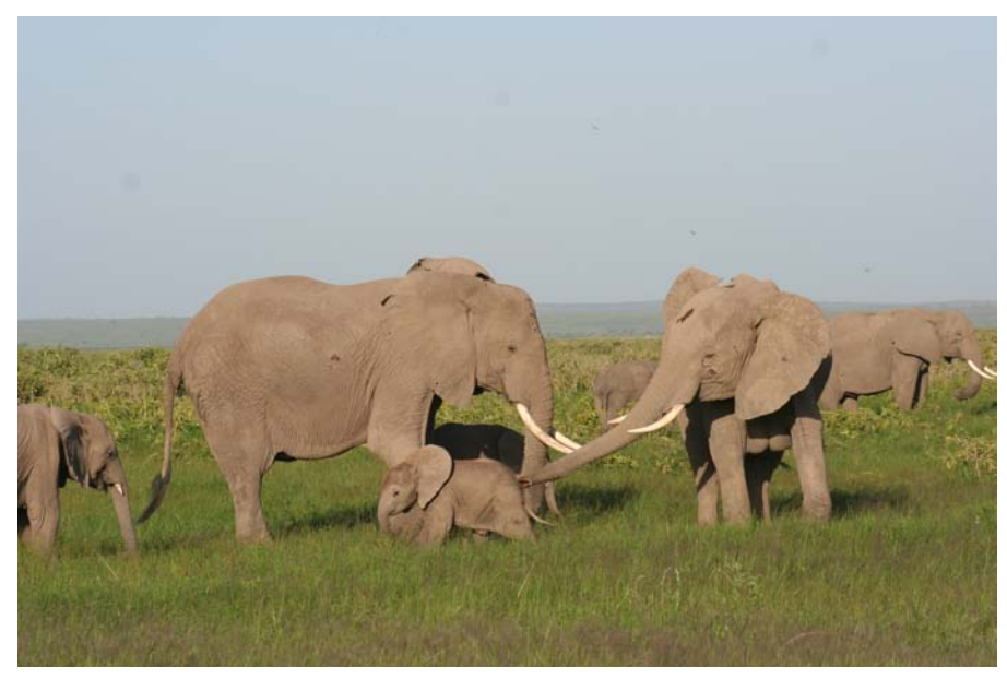
Worldstock.com is very interested in showcasing Wildlife Friendly and other products with similar compelling stories to their large customer base.

Ramirez shared a few additional trade secrets for sellers hoping to appeal to Worldstock.com shoppers. According to