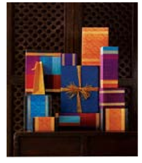
Fairly Traded Paper Products

Experienced buyers in the value chain have these price margins in their head and quickly take a product quote and multiple through to the final