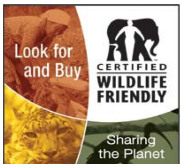
Link your site with sites that already rank high in Google searches.

Perhaps the best method for showing up on Google is to write an article about a topic related to your site that includes a link back to your site because Google frequently visits article directories in search of new content. Submit your piece to one or several good article directories, and once listed your site will soon be added to Google's index. For a good example of a free online Article Directory see <a href="http://ezinearticles.com/">http://ezinearticles.com/</a>. You can also submit your website's content directly to Google from <a href="http://www.google.com/submityourcontent/index.html">http://www.google.com/submityourcontent/index.html</a>.