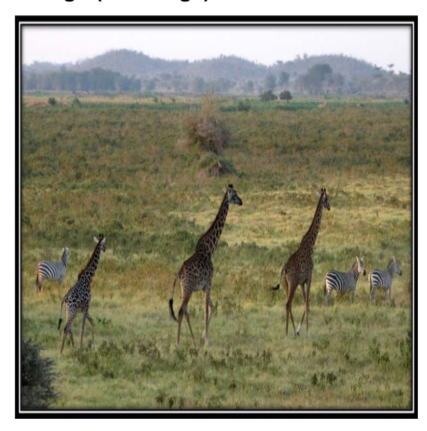
Wildlife Friendly is on the cutting edge of what motivates shoppers to spend money.

Catalogs are always looking for the next new big thing to keep ahead of their competition. And green products are the next new big thing so wildlife friendly and other related products are on the cutting edge