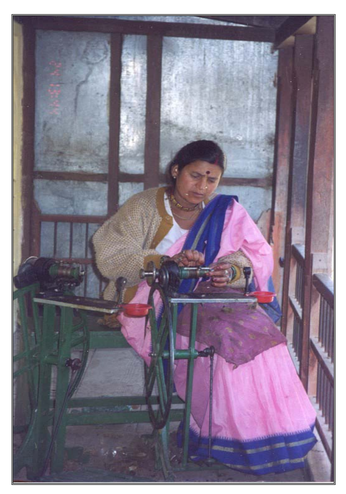
Customers like to feel a connection to the producers of the products they purchase.

For additional guidance on green marketing and reaching green consumers with your wildlife and people story please see the companion tool "Green Marketing Trends – Guidance for Wildlife Friendly Products to Understand and Access Green Markets". If you follow the guidance and do your homework based on the guidance of this and the other two companion